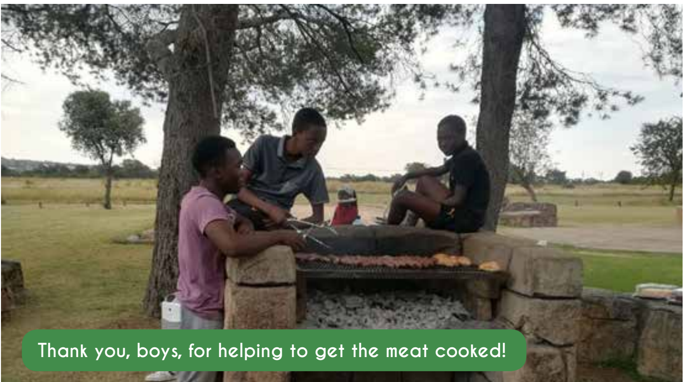
Thank you, boys, for helping to get the meat cooked!