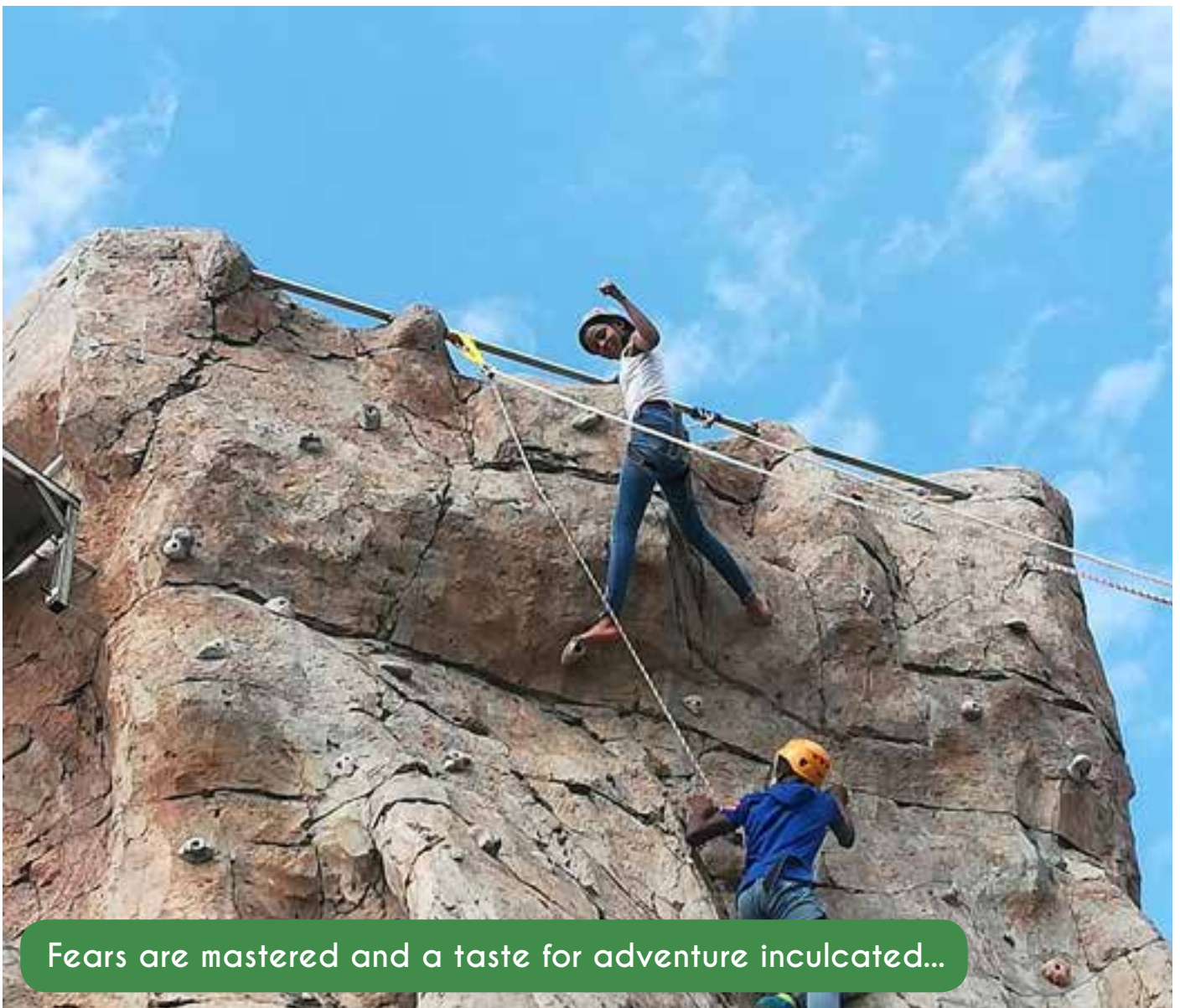
Fears are mastered and a taste for adventure inculcated...