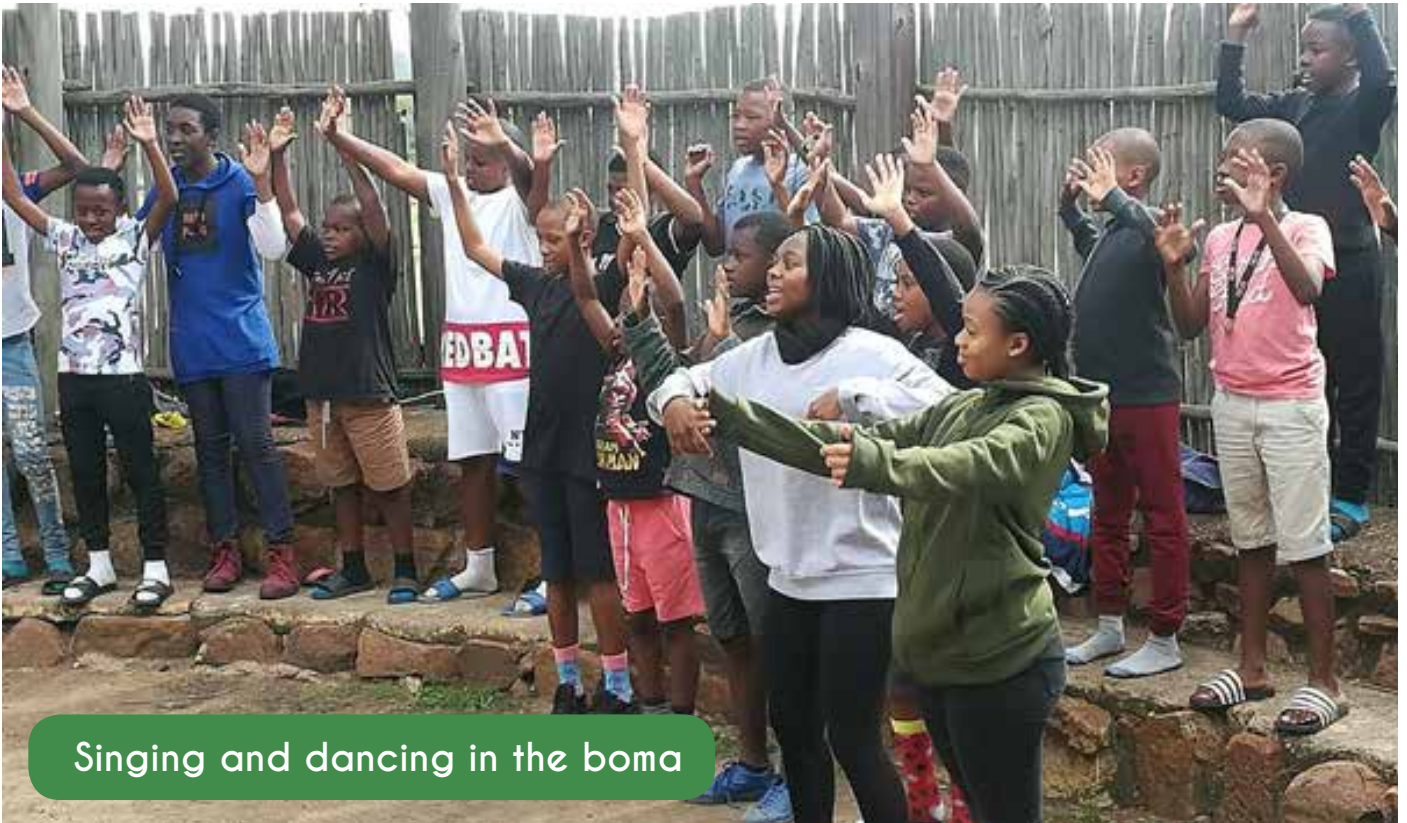
Singing and dancing in the boma

The senior boys at Pro Act also had a braai and the Senior girls had a pizza party.