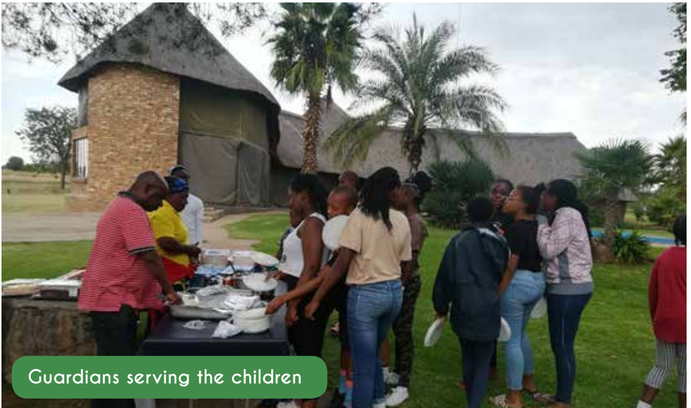
Guardians serving the children