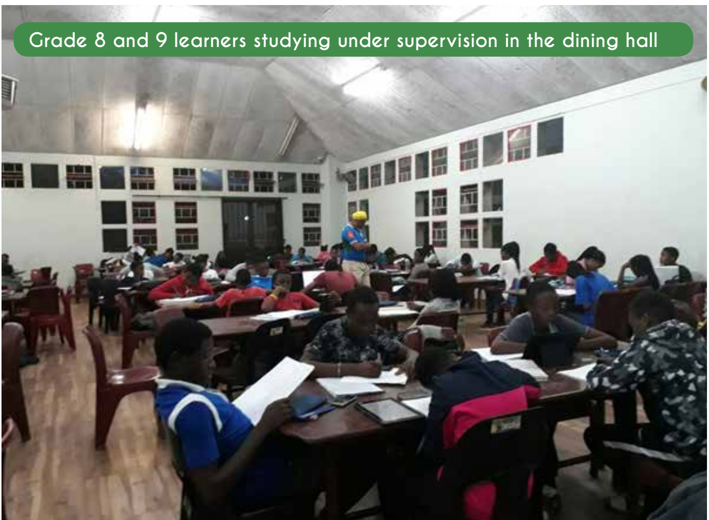
Grade 8 and 9 learners studying under supervision in the dining hall